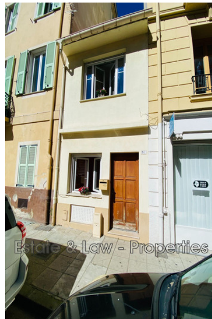
Maison de ville 007 Nice

Fees paid by the owner, no current procedure, information on the risks to which this property is exposed is available on georisques.gouv.fr