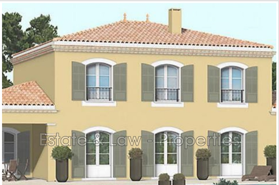
House 017 Callian